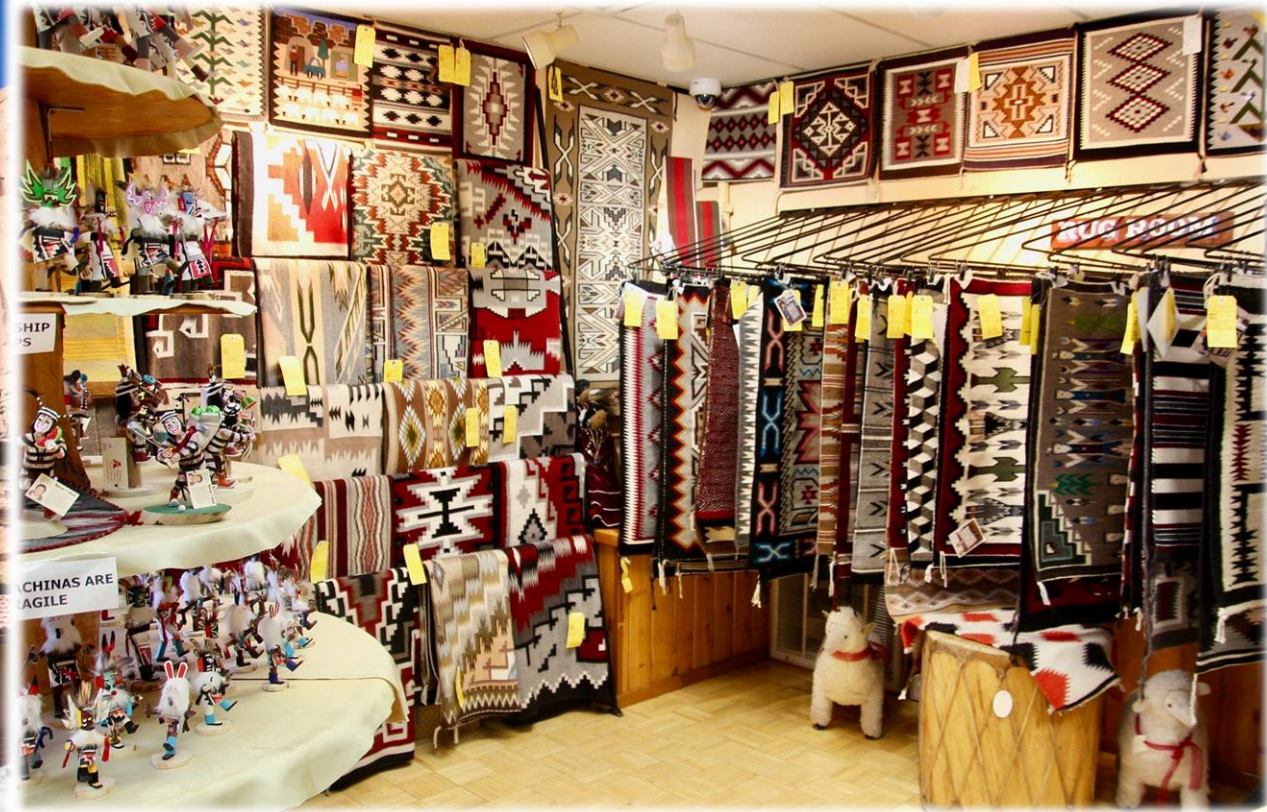
Day 4: Goulding's Lodge