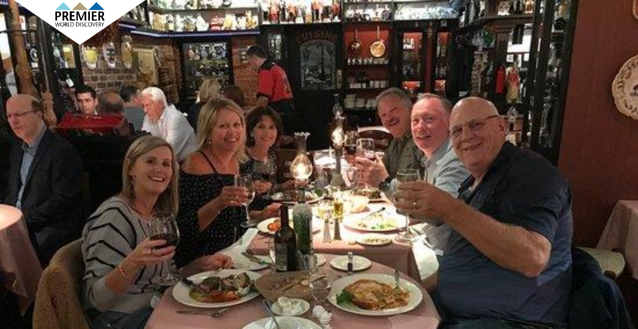
Day 6: Farewell Dinner