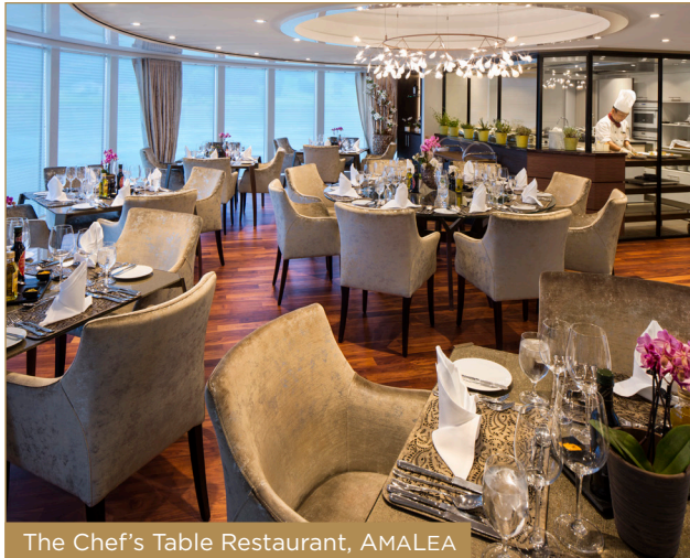
The Chef's Table Restaurant, AMALEA

AmaWaterways' twin-balcony ships represent some of the newest vessels in our fleet. Heated pools with a swim-up bar provide a tranquil environment for viewing stunning mountains and spired skylines. Plus, spacious staterooms afford guests comfort and privacy to rejuvenate while still experiencing the magnificent scenery.