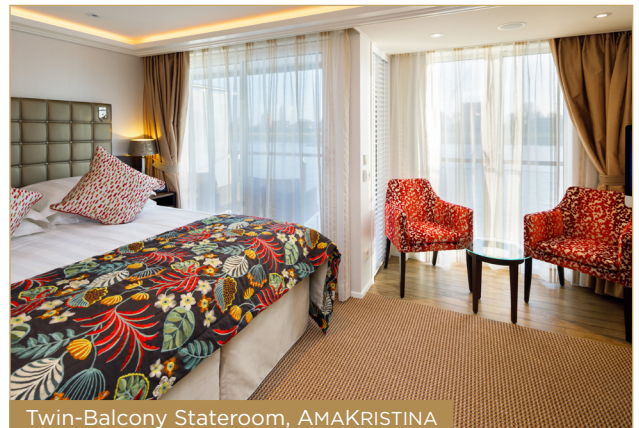
Twin-Balcony Stateroom, AMAKRISTINA